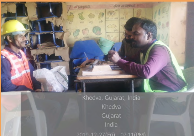
Khedva, Gujarat, India Khedva Gujarat India