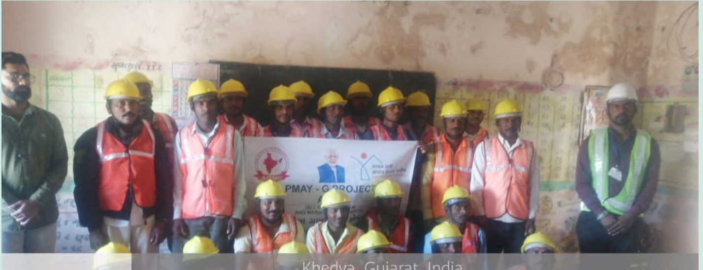
Khedva, Gujarat, India

PMAY-G: Rural Mason assessment was conducted by Palmary Constructions Private Limited on 27th December 2019 at Sabarkantha, Gujarat