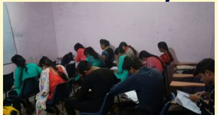
MMKSY- Assistant electrician assessment being conducted by Palmary Constructions Private Limited on 28th August 2019 at Madhya Pradesh.