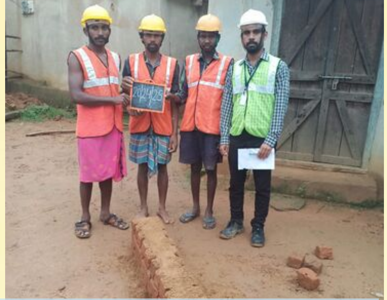
PMAY-G: Rural Mason assessment being conducted by Palmary Constructions Private Limited on 31st August 2019 at Chattisgarh.