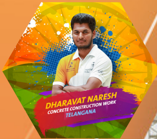
DHARAVAT NARESH CONCRETE CONSTRUCTION WORK TELANGANA