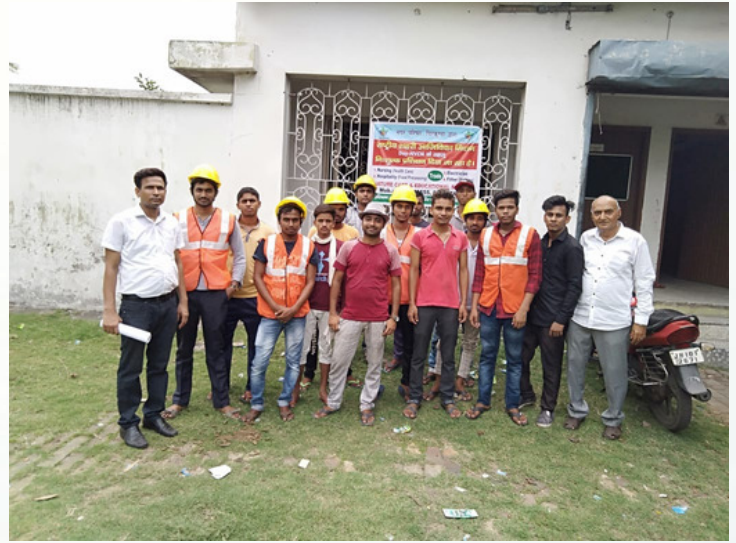
NULM: Assistant Electrician assessment being conducted by Star Projects on 26th June 2019 at Jharkhand.