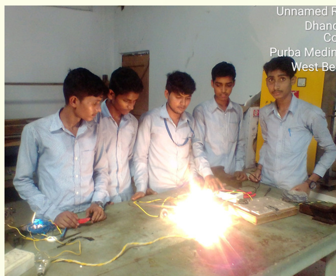
Unnamed R Dhand Co Purba Medin West Ber

PBSSD Scheme - Assistant Surveyor assessment being conducted by Bhavishya Uday Shiksha Evam Baal Chetna Samiti on 17th May 2019 at West Bengal.