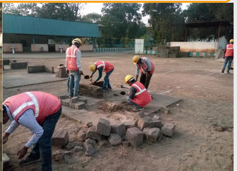
TOT-Rural Mason Level4 & Mason General level 4 (Trainer/Assessor) program being conducted at OPCCRaigarh.