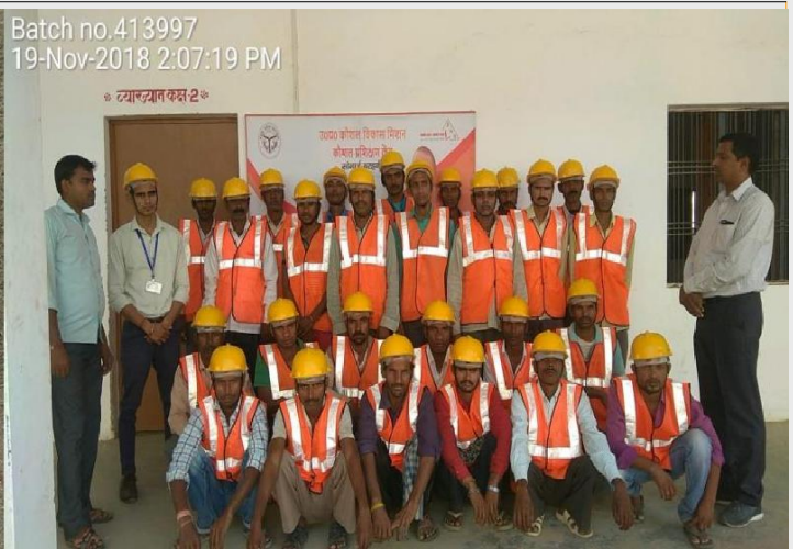
Batch no.413997 19-Nov-2018 2:07:19 PM