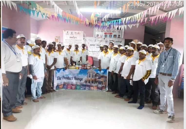
PMKVY RPL-Construction Painter & Decorator Assessment being conducted by Bhavishya Uday Shiksha Exam Bal Chetna Samiti at Bhopal, Madhya Pradesh.