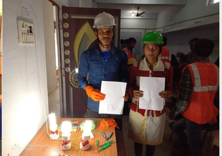
PMKVY- Assistant Electrician Level-3 Assessment being conducted by Palmary Project & Service Private Limited at Umreth, Madhya Pradesh.