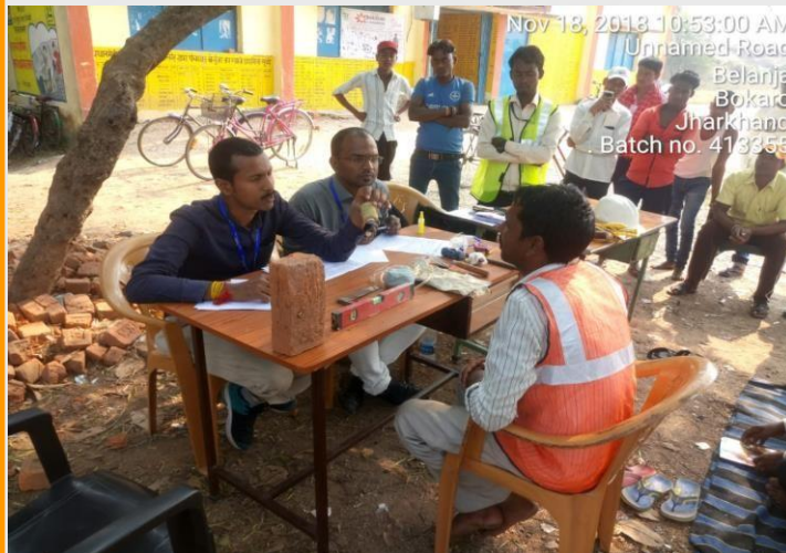
Nov 18, 2018 10:53:00 AM Unnamed Road Belanja Bokaro Jharkhand Batch no. 413355