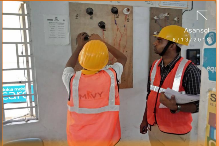
Short Term Training- Assistant Electrician Assessment being conducted by Star Project Services Pvt. Ltd. at Bardhama, West Bengal.