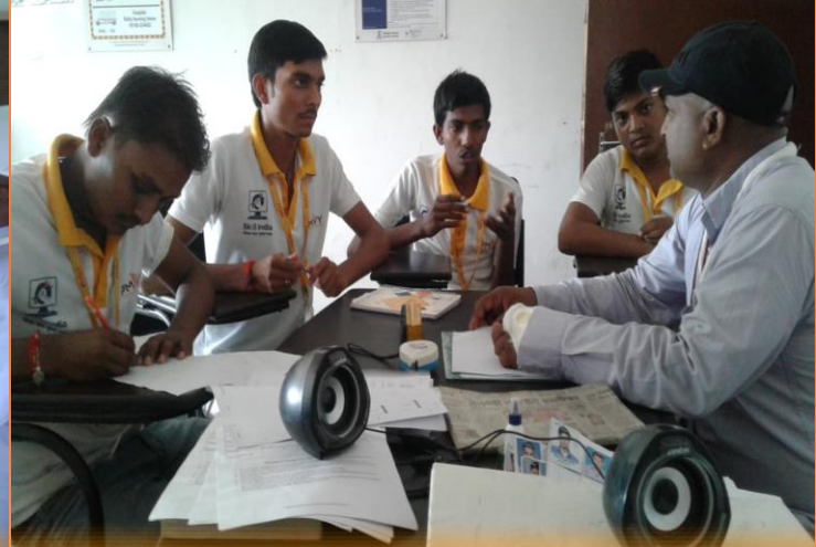
Short Term Training- Assistant Electrician Assessment being conducted by Reliable Projects Services at Banda, Uttar Pradesh.