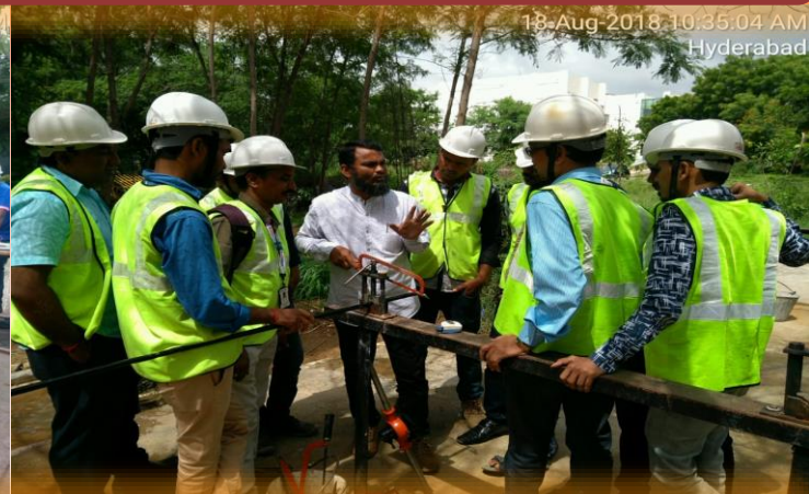
TOT- Assistant Electrician & Tack Welder Assessment program being conducted at NAC Hyderabad.