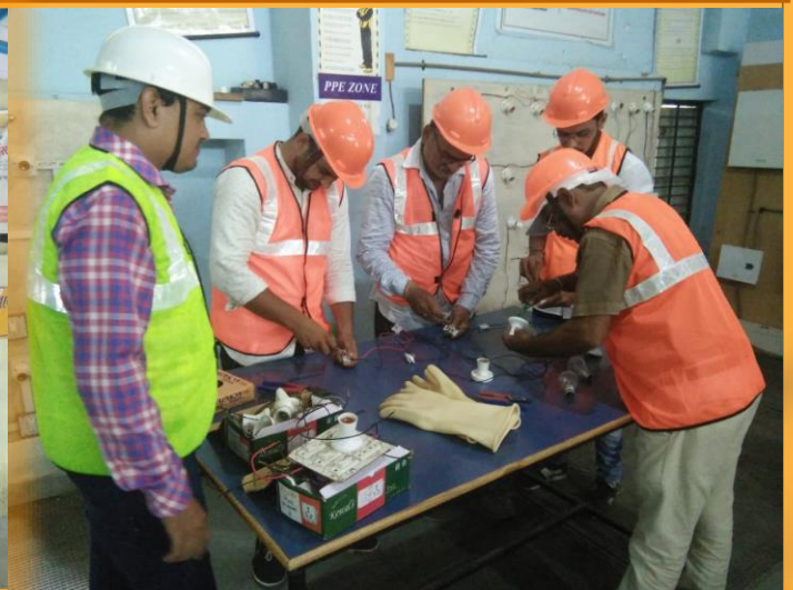
Assessment- Assistant Electrician Level -3 program being Conducted by Proximo at Gandhinagar, Gujarat.