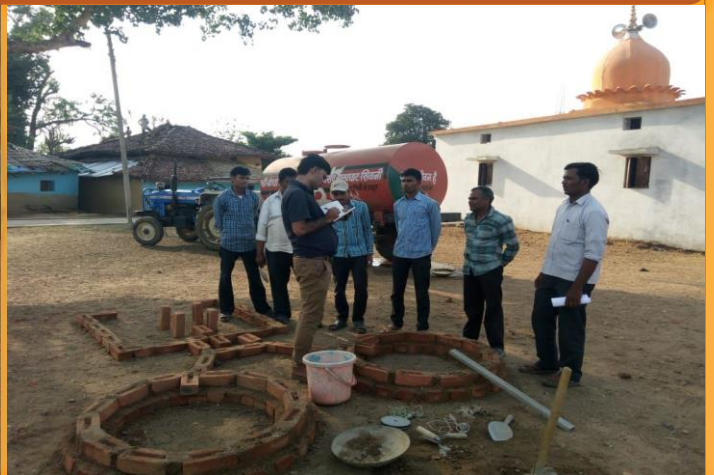
Assessment- Rural Mason Level -4 program being Conducted by Proximo at Seoni, Madhya Pradesh.