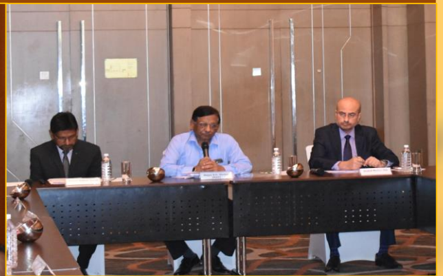
Construction Skill Development Council of India: 19 th Governing Council Meeting held on 22 nd July 2018 at Aerocity New Delhi.