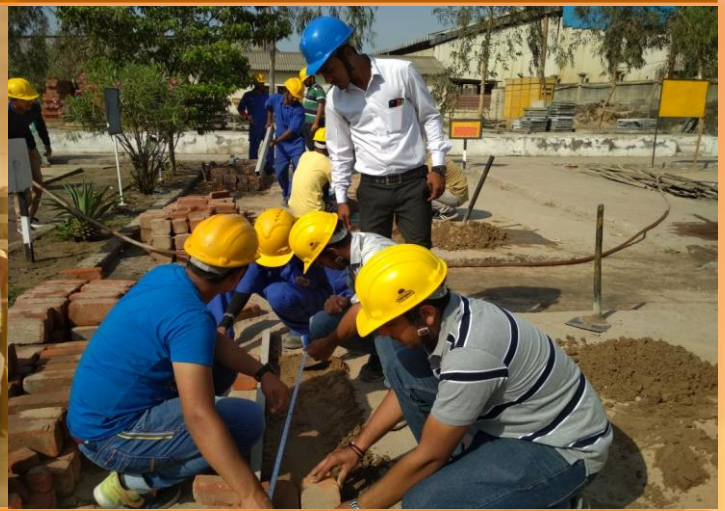
ToT- Rural Mason Demonstrator program being conducted at L&T CSTI Ahmedabad