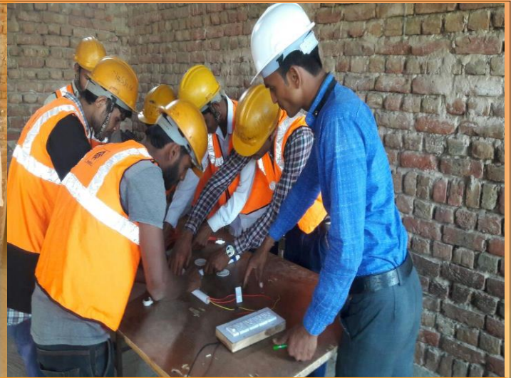
Rural Mason- Assistant Electrician (Level 3) Assessment being conducted at Srijan Sansthan at Bharatpur, Rajasthan. (Total Candidates 30).