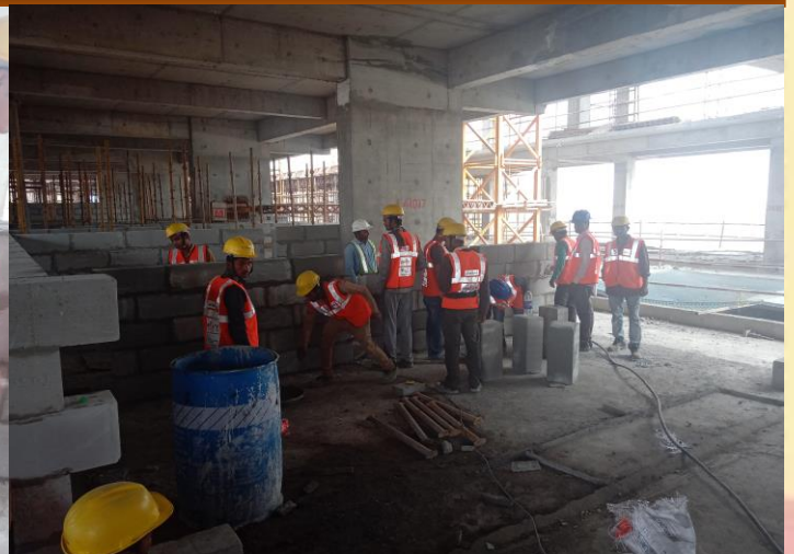
RPL- Assistant Mason Program being conducted by CREDAI, Gurgaon, Haryana (Total Candidates 24).