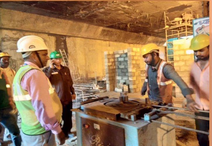
RPL- Assistant Bar Bender & Steel Fixer Assessment being conducted by Labour net Services India Pvt. Ltd. at South West Delhi, Delhi. (Total Candidates 32).