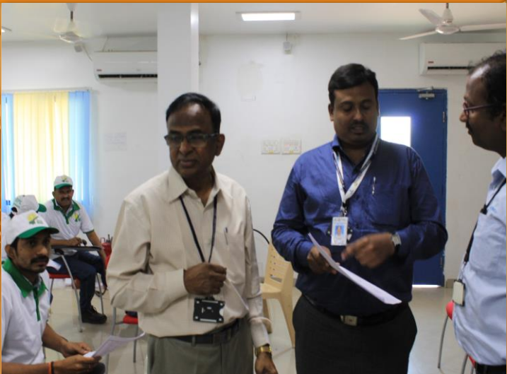
Assessment Surprise visit conducted at Srikakulam, AP for Supervisor EHS.