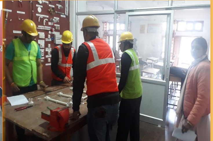
ToT- Assistant Electrician Level 3 (Trainer/Assessor) Program being conducted at SIRDA Skill Development Centre, Sunder Nagar, H.P from 15 Feb 2018 to 25 Feb 2018.