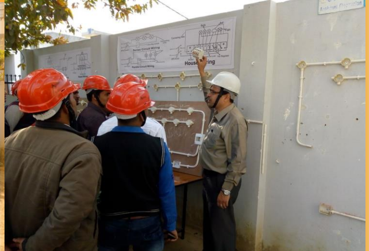
ToT- Assistant Electrician Level 3 (Trainer/Assessor) Program being conducted at SIRDA Skill Development Centre, Sunder Nagar, H.P from 15 Feb 2018 to 25 Feb 2018.