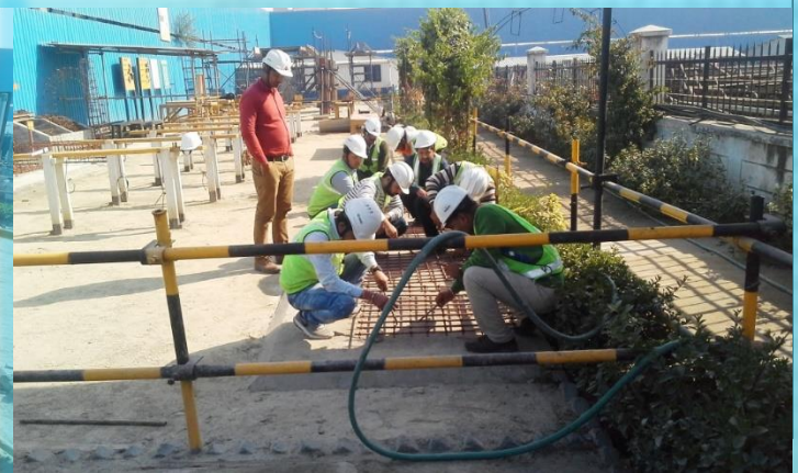
ToT- Bar Bender & Steel Fixer and Shuttering Carpenter at Simplex, New Delhi