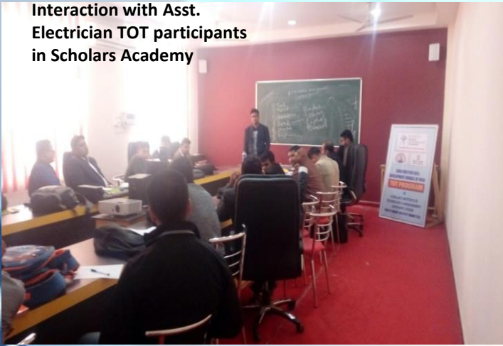
Interaction with Asst. Electrician TOT participants in Scholars Academy