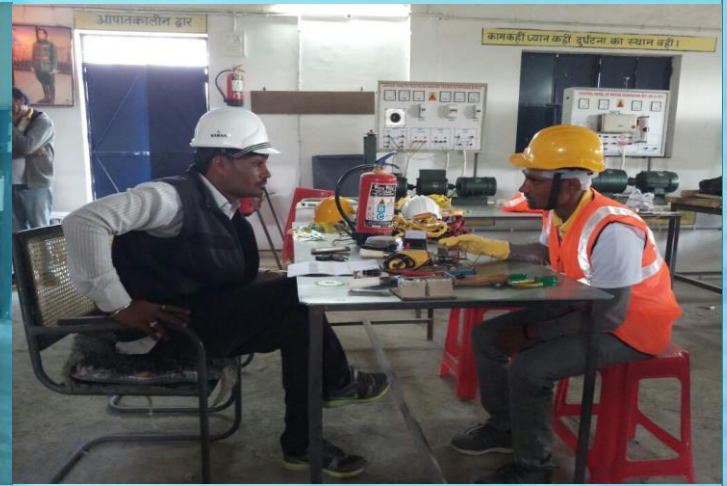
Short Term Training- Assistant Electrician at Sagar, M.P